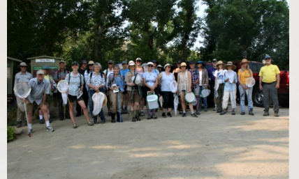
The 2021 4J Count gang

It is a very busy time of the year, and I am looking forward to another trip to Meso-america for study....so, I hope to drop by in the near future. This is me and a local Teotihuacan friend at his shop.